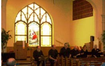
LaMoure Readers Theater presented "Christ in the Concrete City"

The Ninety-Fourth Stated meeting of the Presbytery of the Northern Plains was held on April 25-26, 2008, at the United Presbyterian Church of Jamestown, North Dakota. The members of the LaMoure Readers Theater presented "Christ in the Concrete City" as the opening worship