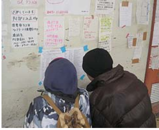
People search display boards for information about missing loved ones. Thousands are still missing.

Presbyterian Disaster Assistance (PDA) is continuing to respond to needs in Japan. Working in cooperation with our partner Church World Service (CWS) and our mission partners in Japan, basic humanitarian needs are being provided. CWS is working with the Japan Platform, a consortium of 32 Japanese non-profits, to provide a coordinated response to the basic needs of those currently living at evacuation sites.